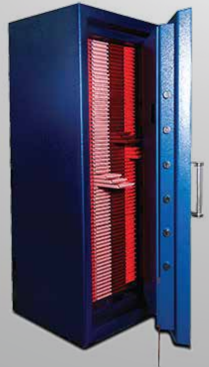
* VdS Approved. EN1143-1 Grade V Safe.