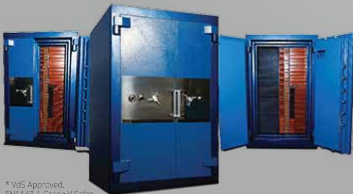
* VdS Approved. EN1143-1 Grade V Safes.