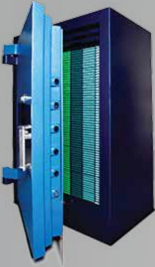
* Custom-Made. TXTL-60X6 Safe.

ISM is a world leader in the safe & vault industry with over a century of experience in safe and vault manufacturing. Our high security safes are approved according to the highest American and European standards.