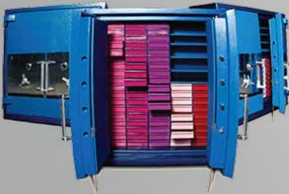
* Custom-Made. TRTL-15 Safes.

Our safes are manufactured using the most advanced methods and best available materials. ISM's highly experienced team of engineers and top craftsman will provide expert technical guidance in order to produce a custom-tailored safe, manufactured to fit your exact specifications.