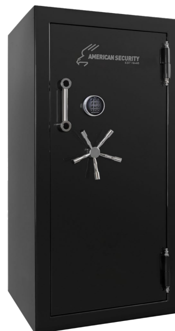
BFII6030 shown with optional finials