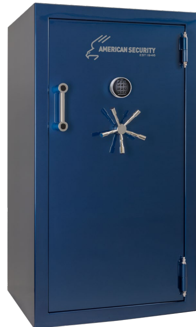
BFX6030 shown with optional finials

Dimensions listed are exterior dimensions. Add 3" on all BF® safes to overall depth for lock and handle.