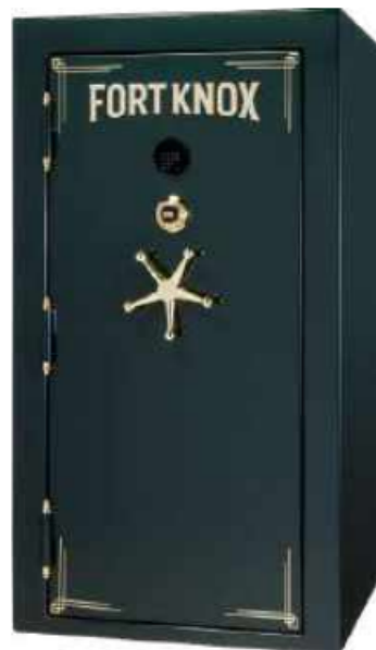
Forest Green Finish, Left Swing