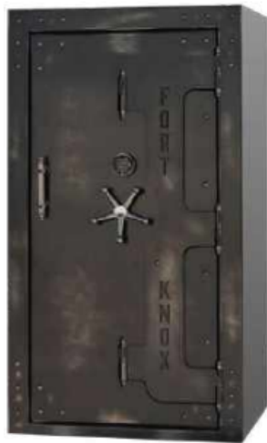
Distressed Finish with Crane Hinge